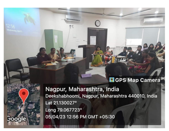
Quiz Competition in progress