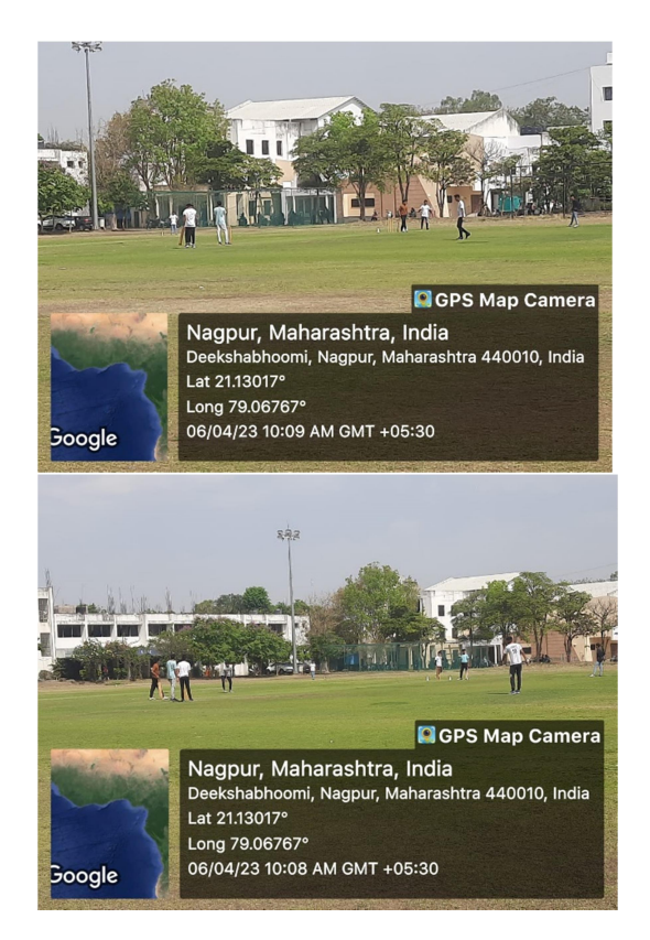
Cricket Match scorers in action