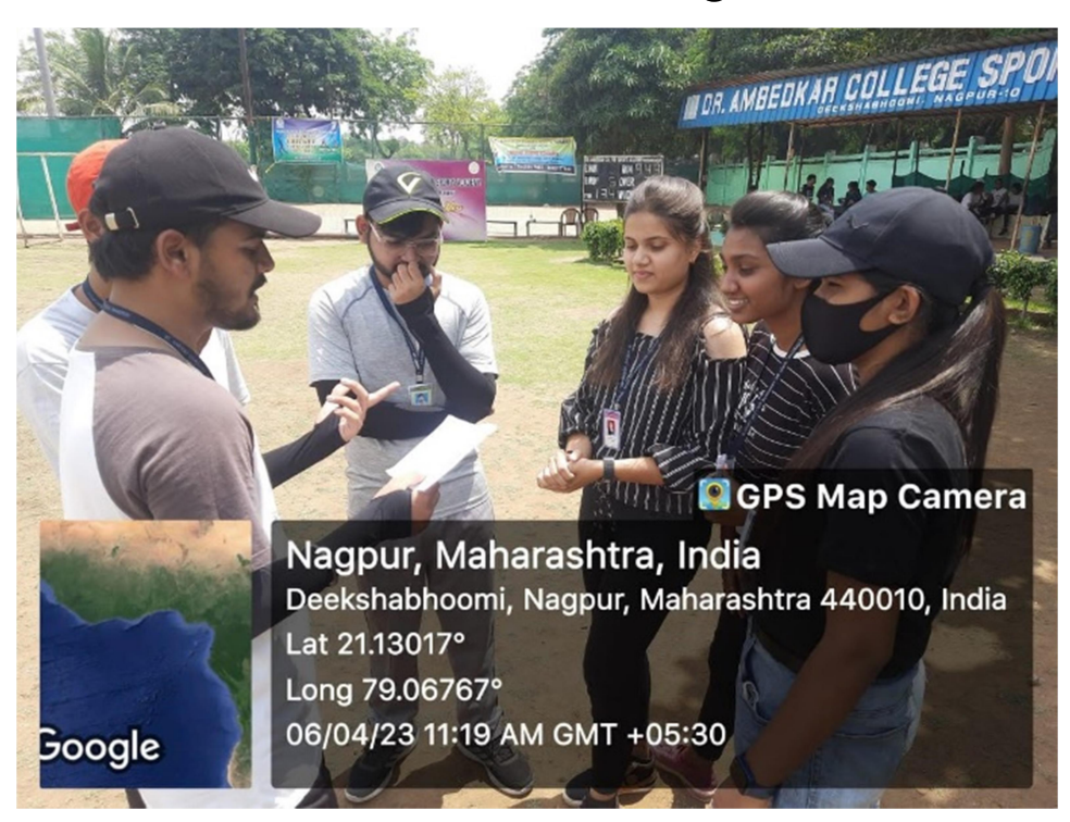
Winner Team of Treasure Hunt