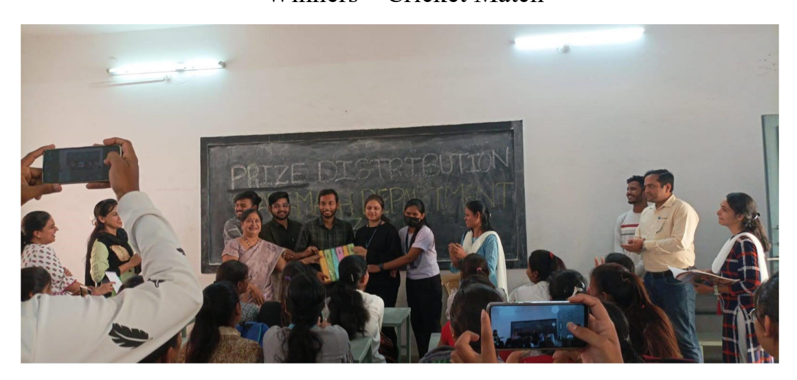
Winners - Treasure Hunt