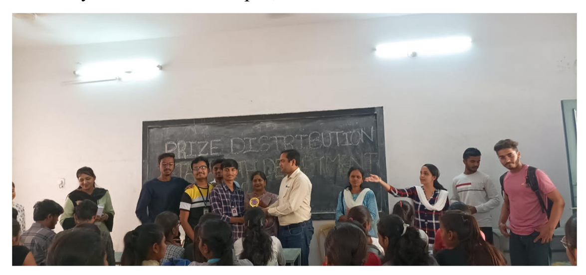
Winners – Tug of War