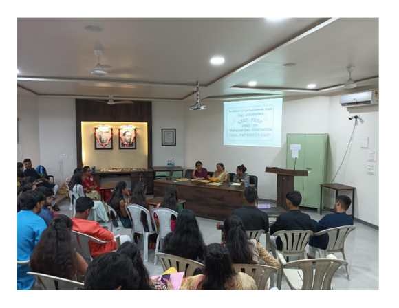
Participating Teams and the audience